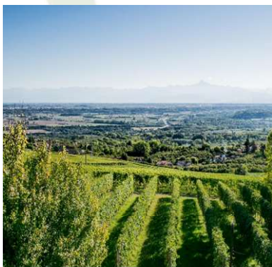
Bosio Family Estate

The Fratelli line is produced by several different families throughout Italy. Each specializes in the indigenous varieties grown in their regions and produce some of the best wines in those areas.